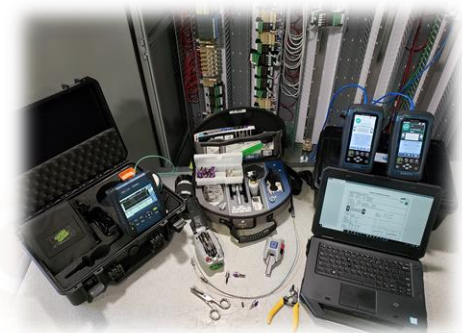
Copper and Fiber Network Testing